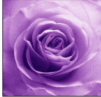
The Dead Never Change

You are more than welcome to have a look at the Healing-Israel website and read the many articles posted there. Enjoy the Reading!