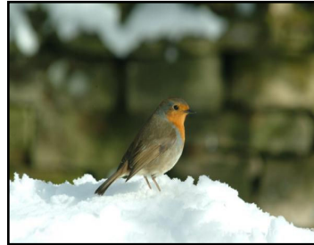
Even in the heart of winter, a little bird could be found to give us hope...

You are more than welcome to have a look at the Healing-Israel website and read the many articles posted there. Articles I have recently posted on the site appear in the "Featured Links" box below. Enjoy the Reading!